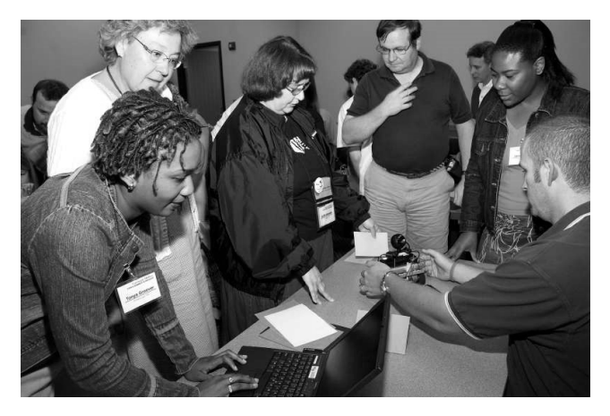
Figure 4: CS4HS teachers programming TeRK Robots

We are also working with CS4HS (www.cs.cmu.edu/cs4hs), an organization at Carnegie Mellon which runs a yearly summer workshop to give high school CS teachers ideas for curricular modules in the month of class after the CS AP exam. At last July's inaugural workshop, we presented a TeRK based robot to 50 teachers and gave teams of six or seven teachers one hour to complete one of our first fully developed assignments: figure 4 shows one such team. Teachers were told to average the pixel values from the robot's camera, and cause the robot to react to flash-cards of different colors - we didn't specify how the robot should react, although we gave the example that a green card could cause the robot to move forward, while red could mean stop or back up. In the hour provided, most teams were able to successfully complete this assignment, which naturally highlights concepts from the arrays, flow, and simple I/O modules. In a striking example of the motivational power of robotics, those teams which did not finish the assignment refused to stop working, even though another session was scheduled immediately after ours. As we were not prepared to provide full curricular materials, this year's session was intended as a short demonstration of the advantages of using robots in CS. We have been invited back for an extended session next year and will provide teachers with sufficient curricular materials to allow them to run a robotics module in their classes.