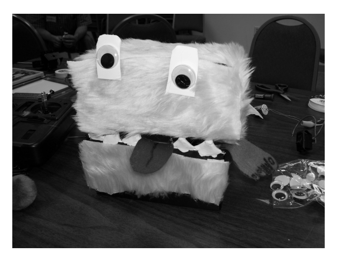
Figure 3: A Summer Robot Diaries Creation

We have taken the first steps towards creating the Robot Diary kit and interface software. In summer 2006 we created a participatory design workshop in which several middle school-age girls spent two hours once per week for six weeks with us. The workshop had multiple goals; for the girls, we aimed to make the experience enjoyable, increase their confidence with regards to technology, and teach them basic robotics skills and knowledge; for us, we wished to use this experience to identify key engineering and design requirements for the future Robot Diaries kit, and develop a participatory design toolkit for us to use to introduce other girls to Robot Diaries in future workshops. As a major goal of the workshop was to discover what kind of physical robot design was attractive to the girls, we did not use the Qwerk during this workshop; instead girls created robots out of prototyping materials such as cardboard boxes, fake fur, DC motors, servos, LEDs, battery packs, alligator clips, and bells.