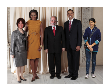
With our new friends