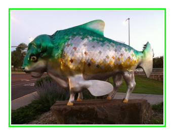
Great Falls art

A drawback of a three-week road trip is that you get kind of tired of hotels, even when you're staying in a $1,000-a-night suite at Motel 6. So we were glad to finally connect with friends (you don't really care who, do you?) who were willing to put us up in a real house—or at least in a tent in their driveway. Too bad we could only stay one night.