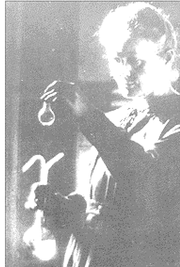
M. Maria Skłodowska-Curie performing a carefully designed experiment

Good software testing should be more like a carefully designed laboratory experiment than a random walk in an electrical storm--or worse. Testers are engineers, after all.