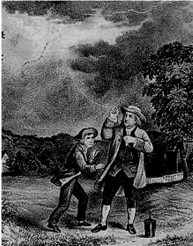
Ben Franklin standing in a thunderstorm hoping to get hit by lightning

Good software testing should be more like a carefully designed laboratory experiment than a random walk in an electrical storm--or worse. Testers are engineers, after all.